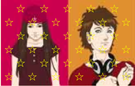
Film with the same pattern throughout

The film pattern is transferred to the entire surface of the varnish coating.