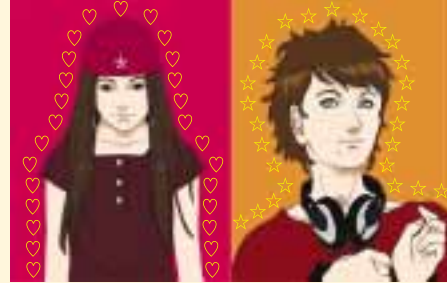
Film for treating part of the image

The film pattern is transferred to only selected parts of the varnish coating.